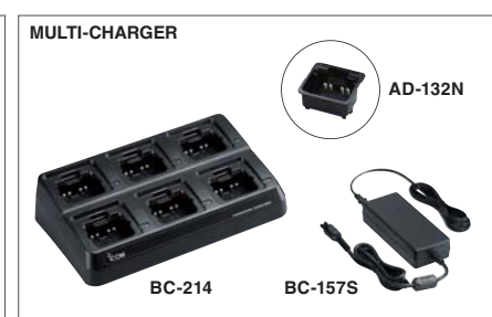
Charges up to six BP-290 batteries in 2.8 hours (approx.). AD-132N is supplied with BC-214, depending on version.